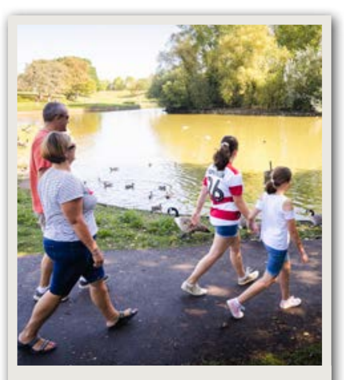
Don't forget to share your visit with us online by tagging @visitdoncaster

If food's your thing you're spoilt for choice in Doncaster. From cozy country pubs to fine dining, cafés and more – check out our website for the latest and greatest places to eat.